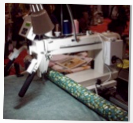
QBOT AT HOUSTON QUILT MARKET